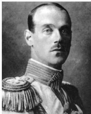
Tsar Michael II died June 12, 1918

What is important about that as concerns this current Unsealing #525 is that the June 12, 1918, death of pseudo-Tsar Michael II occurred 6, or VI, years before the June 12, 1924, birth of George H. W. Bush, for the prophetic purpose of emphasizing the direct shift of 'Michael the Archangel' power and protection from Third Rome Romanov Christian Autocracy to Fourth Rome U.S. Christian Democracy. In truth though, each system was/is of man (represented by the number 6), not God.