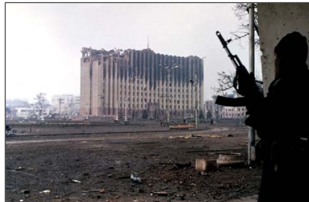
A Chechen fighter near the Presidential Palace in Grozny, January 1995

Daniel 12:1 (KJV) And at that time SHALL MICHAEL [the Archangel] STAND UP , the great prince which standeth for THE CHILDREN OF THY PEOPLE : and there shall be A [Grozny] TIME OF TROUBLE , such as never was since there was a nation even to that same time: and at that time thy people shall be delivered, every one that shall be found written in the book.