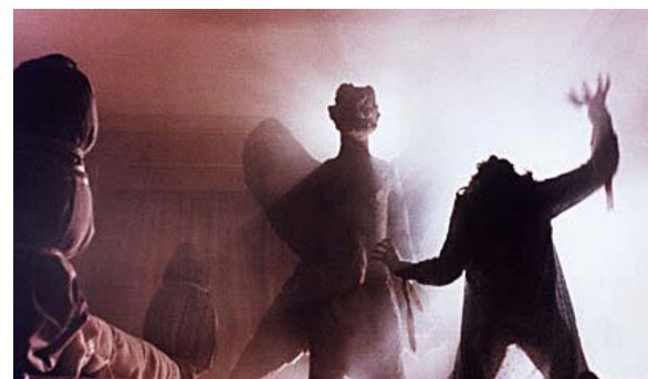
Scene with Pazuzu from The Exorcist