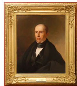
Francis Preston Blair

On the eve of the Civil War, Robert E. Lee’s life’s work had been in the Army of the United States. He served during the Mexican War. The Civil War began at Fort Sumter, South Carolina, on April 12, 1861. On April 18, President Abraham Lincoln, through Francis Preston Blair ( right ), offered Lee command of the Union Army in a meeting at the Blair House , across the street from the White House. Blair’s offer to Lee forced Lee to choose between his strong conviction to see the country united in perpetuity and his responsibility to family, friends, and his native Virginia. A heart-