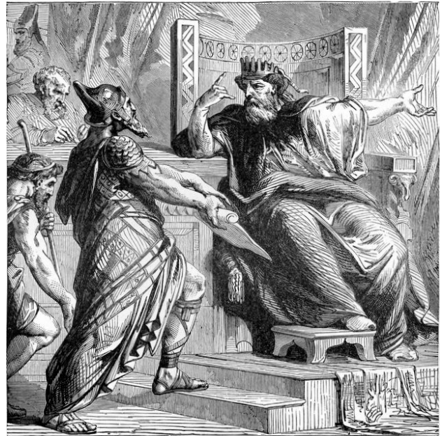
David orders Israel numbered

9 And the LORD spake unto Gad, David's seer, saying,