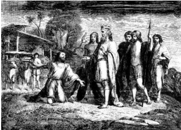
Depiction of Ornan the Jebusite offering his threshingfloor to David

Ornan's threshingfloor represents the building of the House of God, as defined by the separation of the Wheat from the Chaff through the critical aspect of the Cross vs. the Sword .