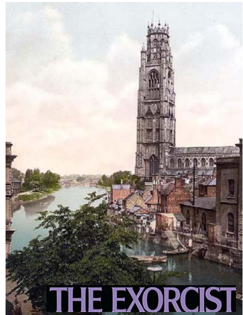
St. Botolph’s Church on the River Witham, Boston, England

encouraged those who disliked the lack of religious freedom in England to join the Massachusetts Bay Company, which in 1630 would found the city of Boston, Massachusetts – named for Boston, Lincolnshire, due to the significant number of Puritan immigrants from there. John Cotton himself eventually immigrated to Boston, Massachusetts, in 1633.