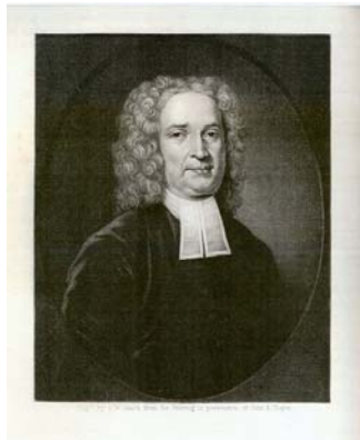
John Cotton (1585–1652)

From Boston. Boston, Lincolnshire, England, was a hotbed of religious dissent against the Church of England. In 1612, John Cotton became a long-serving vicar (an Anglican, or Church of England, minister) of St. Botolph’s Church in Boston, but came under the unfavorable eye of the Church of England for his non-conformist preaching. He