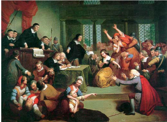
A witch trial in Salem (above), map of Salem Village, 1692 (right)