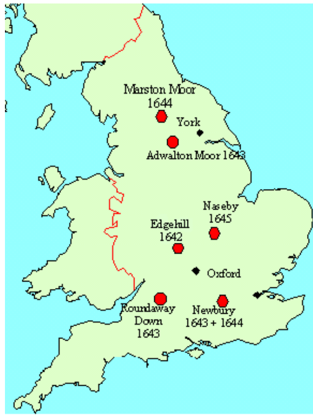
The primary battles of the English Civil War