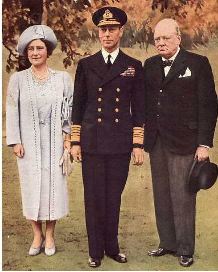
King George VI called for a National Day of Prayer

The May 26 th National Day of Prayer. On May 26, 1940, day one of Operation Dynamo, a National Day of Prayer was declared in Britain. The BBC broadcast a morning service from Westminster Abbey during which the Archbishop of Canterbury, senior primate of the Anglican Church (Church of England), led prayers “for our soldiers in dire peril in France.”