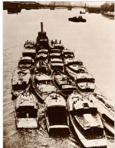
(above) ‘Little Ships’ being towed down the Thames at the start of ‘Operation Dynamo’, the rescue of British soldiers off the beaches of Dunkirk

Revelation 13:2 (KJV) And THE BEAST [out of the Sea] WHICH I SAW WAS LIKE UNTO A LEOPARD , and HIS FEET WERE AS THE FEET OF A BEAR , and HIS MOUTH AS THE MOUTH OF A LION : and THE [Great Red] DRAGON [Satan] GAVE HIM [the Beast out of the Sea] HIS POWER, AND HIS SEAT, AND GREAT AUTHORITY.