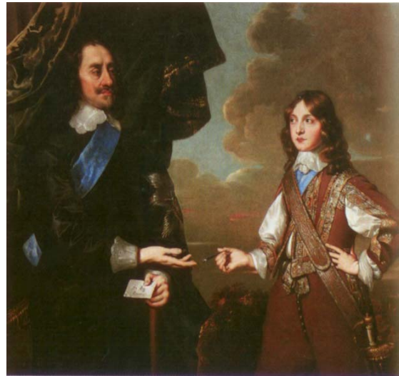
The future James II with his father, Charles I

In 1685, Charles II died without legitimate issue and his brother, James, Duke of York, became King James II of Great Britain. John Churchill was promoted to major-general in July 1685 and appointed head of the loyalist troops, but then was subordinated to Louis de Duras. It is believed that this lack of confidence in him by the Crown was what eventually turned John Churchill from his loyalty to the Stuart kings which had been the earmark of his father.