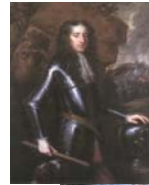
William III of Orange and his invasion fleet

and UPON HIS [Ten] HORNS TEN CROWNS [representing the Crown Shift to the U.S. Bill of Rights, whose antecedent was the English Bill of Rights of 1689, the advent of which was aided by the defection of John Churchill in 1688 from King James II to William III of Orange], and upon his heads the name of blasphemy.