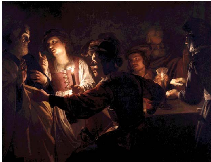
The Denial of Peter by Gerard (Gerrit) van Honthorst

27 Peter then denied again [Peter's third denial]: and immediately the cock crew.