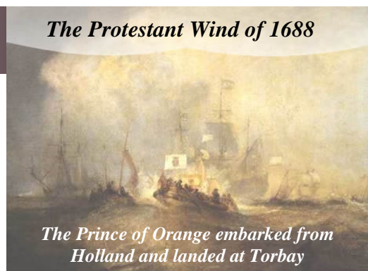
The Protestant Wind of 1688

Revelation 13:1 (KJV) And I STOOD UPON THE SAND OF THE SEA [shore] [November 5, 1688, at Torbay in southwestern England], and saw A BEAST RISE UP OUT OF THE SEA [William of Orange of the Netherlands, invading England to establish it as a Protestant kingdom] HAVING SEVEN HEADS AND TEN HORNS, and UPON HIS [Ten] HORNS TEN CROWNS [representing the Crown Shift to the U.S. Bill of Rights, whose antecedent was the English Bill of Rights of 1689, the advent of which was aided by the defection of John Churchill in 1688 from King James II to William III of Orange], and upon his heads the name of blasphemy.