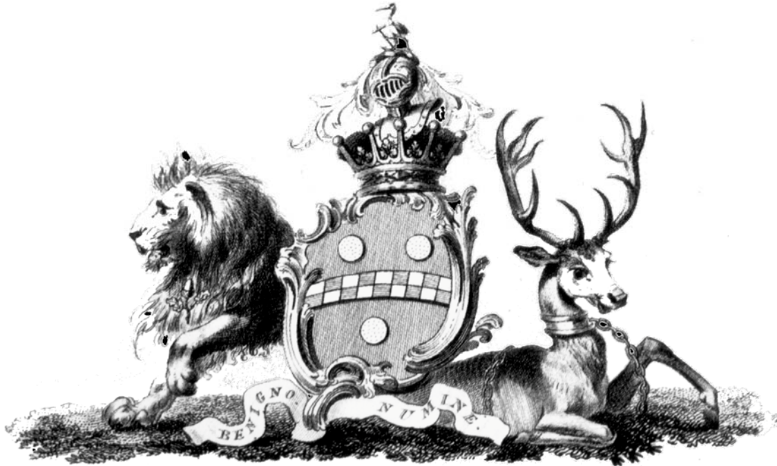
Coat of Arms of the Pitt family

8/8 of ' 88 (1588), that is, 8/8 of the 88 th year of the 8 th century after the 8 th century, and (b) the successful invasion of the Dutch Armada which began on October 19 (O.S.) = 8/8 of ' 88 (1688)], and go into perdition: and they that dwell on the earth shall wonder, whose names were not written in the book of life from the foundation of the world, when they behold the beast that was, and is not, and yet is.