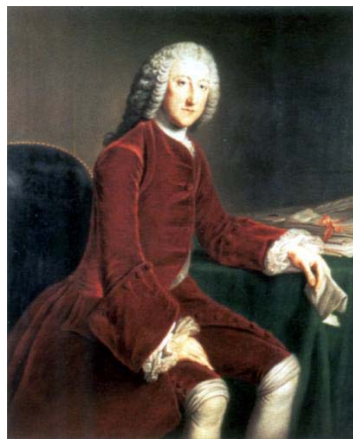
William Pitt, the Elder

Key Understanding: Double William Pitts . There were double ‘risings’ of Protestant England out of the Netherlands – through the defeat of the Spanish Armada in 1588 and the