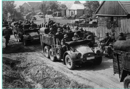
Germany invaded Poland on September 1, 1939

The Phony War phase of World War II would end a few months later on May 10, 1940, with the beginning of Hitler's invasion of Belgium, Luxembourg, the Netherlands, and France. The war was then for real. Winston Churchill became the Prime Minister of Great Britain the same day.