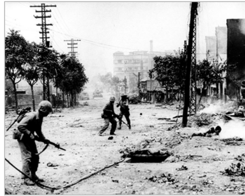
Urban combat in Seoul, 1950, as U.S. Marines fight North Koreans holding the city

The United States, which had withdrawn almost all its forces from Korea to Japan in the previous two years, immediately sent them back and rallied support from the United Nations. An international force of 16 countries, including Turkey, Australia, Greece, New Zealand, and Britain, fought alongside the U.S. and South Korean forces.