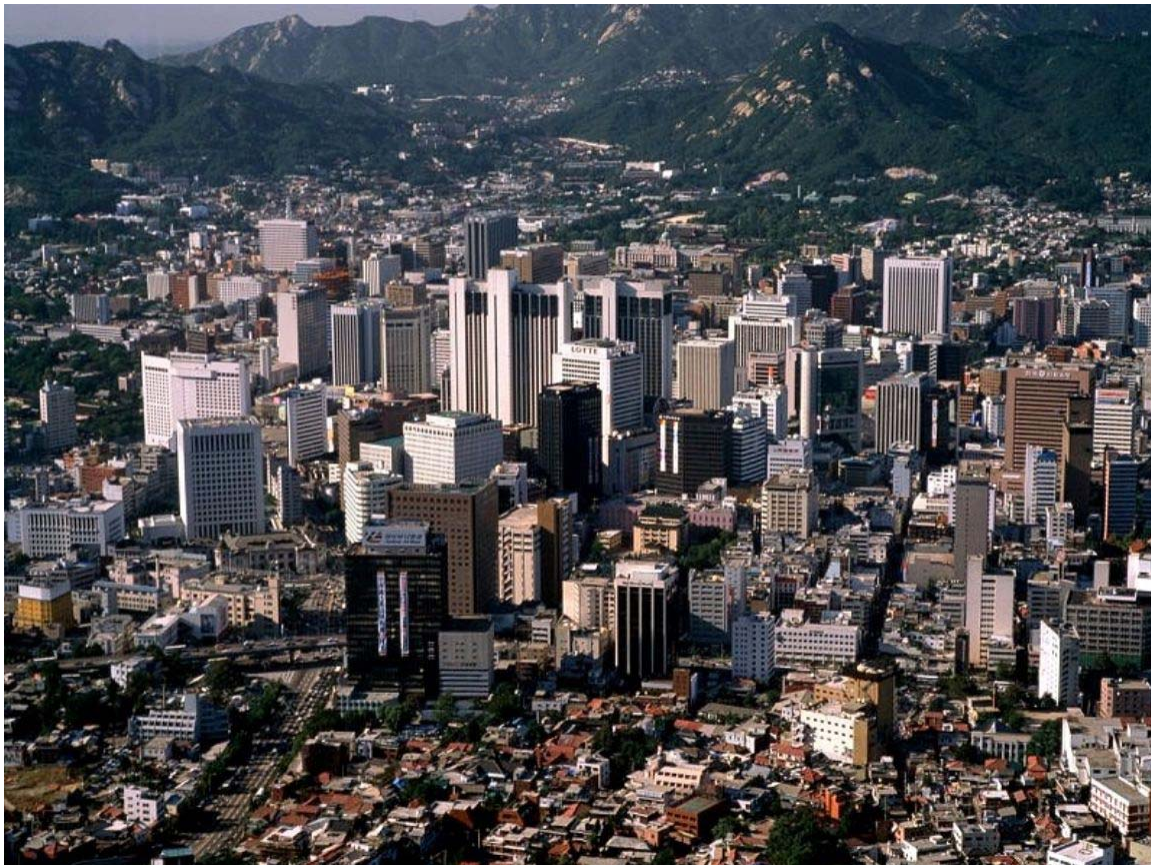
Seoul, South Korea

Daniel 7:21 (KJV) I beheld, and THE SAME HORN [the Daniel 7:8 Little Horn Nation of America] MADE WAR WITH THE [Church-ill] SAINTS , and PREVAILED AGAINST THEM ;