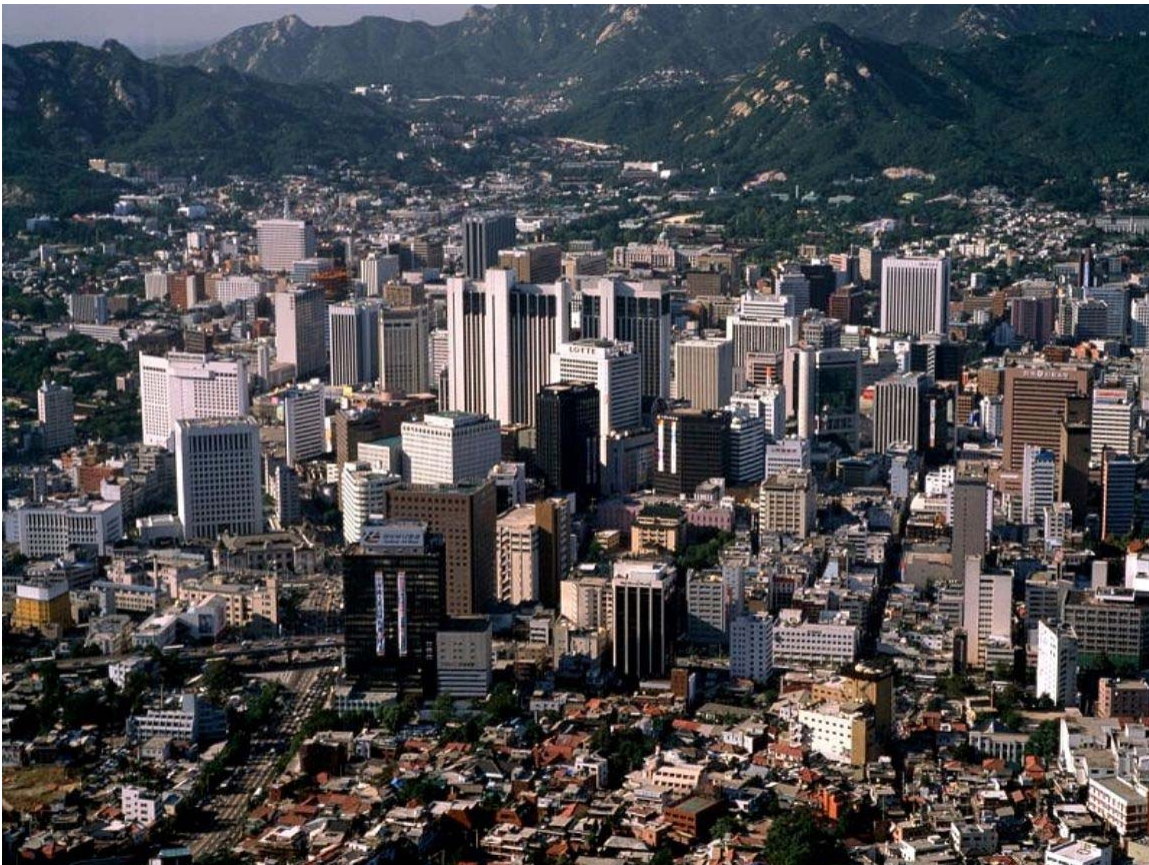
Seoul, South Korea

Daniel 7:21 (KJV) I beheld, and THE SAME HORN [the Daniel 7:8 Little Horn Nation of America] MADE WAR WITH THE [Church-ill] SAINTS , and PREVAILED AGAINST THEM ;