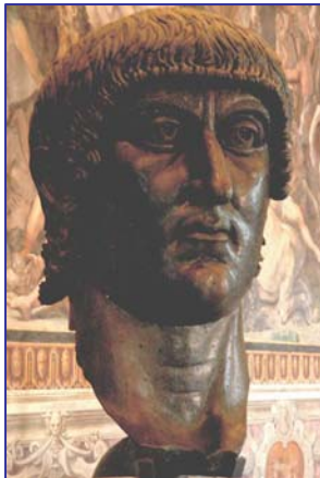
Constantine the Great, at the Musei Capitolini, Rome

Constantine's famous horse ride from Nicomedia (modern day Izmit, Turkey) to the English Channel (continued). The next morning Galerius was still undecided. After purposely remaining in his room until noon, he ultimately sent for Constantine. What Galerius had decided to say to Constantine will never be known, for his officers explained that Constantine had walked straight out the previous evening, with the authority given him, and was now some fifteen hours ahead on the postal roads. Galerius was furious. He instantly ordered pursuit. The reply was brought back that the roads had been cleared of post-horses.