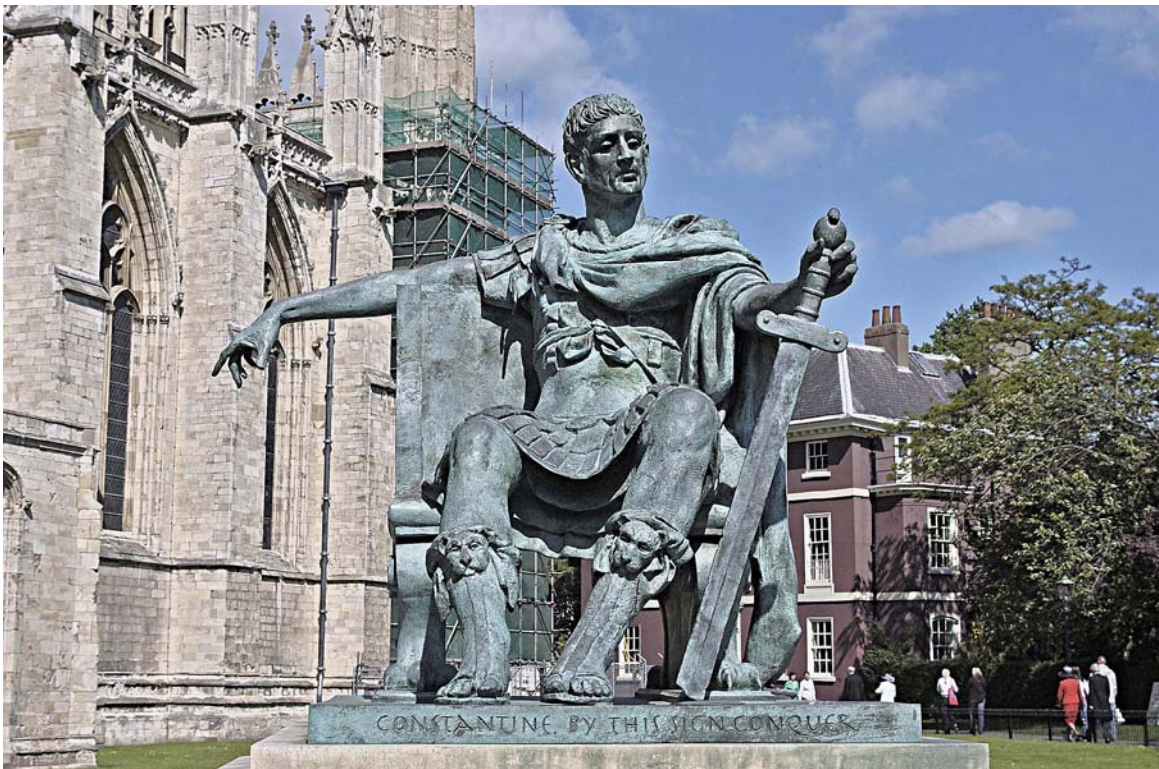
The Statue of Constantine at York

Key Understanding: Constantine's long horseback ride foretold of his coming role as the Revelation 6:2 white horse rider. The Lord ordained Constantine to embark on the longest continuous horseback ride recorded in the ancient world so as to further illustrate his coming role in Revelation 6:2 as the White Horse Rider. Constantine would die the next year, in 306. Constantine would sit on his father's throne, and go forth conquering and to conquer.