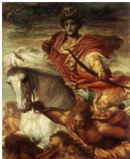
White Horse Rider

Woodrow Wilson also has an enormous part in the fulfillment of Revelation 6:2: