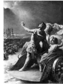
Constantine sees a vision in the sky

Revelation 6:2 (KJV) And I saw, and behold A WHITE HORSE: and HE [Constantine the Great] THAT SAT ON HIM HAD A BOW; and A CROWN [of his father's (Constantius's) throne] WAS GIVEN UNTO HIM [at York]: and HE WENT FORTH CONQUERING, AND TO CONQUER. [Constantine sat on his earthly father's throne through the Sword . He conquered the entire Roman Empire and reigned on the earth in the name of the Heavenly Father.]