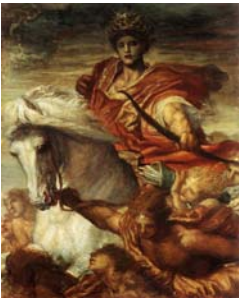
White Horse Rider

Constantine the Great is a monumental part of the fulfillment of Revelation 6:2: