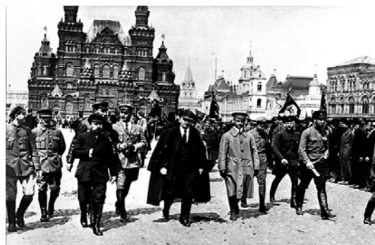
V. I. Lenin, joined by his military commanders, marches through Red Square

Revelation 6:3-4 (KJV) And when he had opened THE SECOND SEAL , I heard the second beast say, Come and see. 4 And there went out ANOTHER HORSE THAT WAS RED : and power was given to him that sat thereon to take peace from the earth, and that they should kill one another: and there was given unto him a great sword.