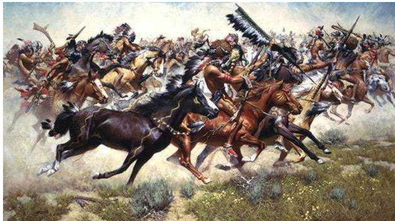
The Battle of Little Bighorn