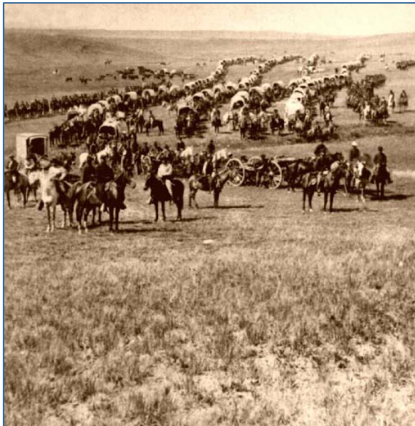
(left) George Armstrong Custer's camp prior to the Battle of Little Bighorn; (below) Last Stand, Little Bighorn Battlefield, Montana

6 And I heard a voice in the midst of the four beasts say, A measure of wheat for a penny, and three measures of barley for a penny; and see thou hurt not the oil and the wine.