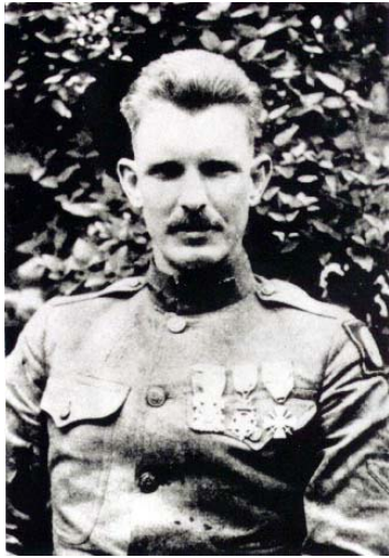
Sergeant Alvin York

Sergeant York, the man. The namesake of Ronald Reagan’s black horse, Sergeant York, was America’s greatest soldier hero of World War I, Sergeant Alvin York. On October 8, 1918, York was a member of a patrol sent to silence German machine-gun nests. In this single battle, he killed about 25 soldiers and forced a German major to order the surrender of about 130 others, completely overtaking a German-controlled hill. York received the Congressional Medal of Honor for his deed. French military leader Marshall Ferdinand Foch called it “the greatest thing accomplished by any private soldier of all the armies of Europe.” York was a corporal at