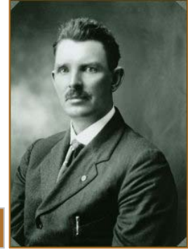
Sergeant Alvin York