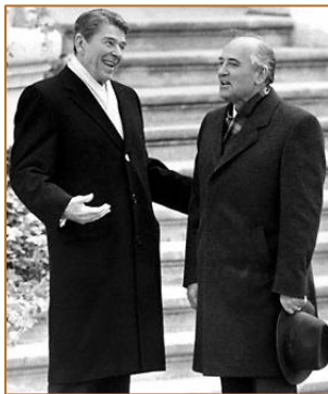
Ronald Reagan (left)

Revelation 6:5 (KJV) And when he had opened THE THIRD SEAL , I heard the third beast say, Come and see. And I beheld, and lo A BLACK HORSE ; and he [Ronald Reagan, who died on June 5, 2004, symbolically dismounting for the last time the black horse, Sergeant York] that sat on him had A PAIR OF BALANCES IN HIS HAND.