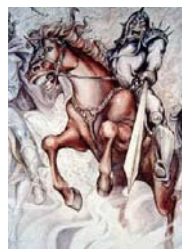
Red Horse Rider

On November 7 (October 25 on the old Russian calendar), 1917, armed workers led by the Bolsheviks took control over Petrograd. Early that evening, the Winter Palace, headquarters of the Alexander Kerensky-led democratic Provisional Government, was seized. Members of its government were arrested. Then, after a bloody struggle in Moscow on November 15, 1917, leaving over 4,000 killed, the Bolsheviks controlled the city. [One source on this is World Book Encyclopedia , Vol. 20, p. 54, © 1990, under Union of Soviet Socialist Republics.]