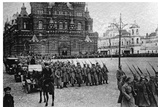
Bolshevik forces marching in Red Square, undated photo