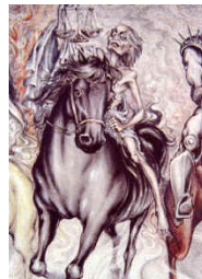
Black Horse Rider

Remember, this time period reflected the birth of the Red Beast (and Red Horse Rider) Soviet Union as well as the second ascension of the Scarlet Beast (and Black Horse Rider) America.