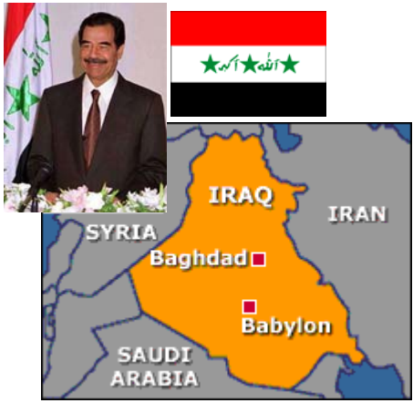
The Saddam Hussein-led regime in Iraq is the pretender Babylon the Great of Revelation 18

Let's examine this further in the next Unsealing.