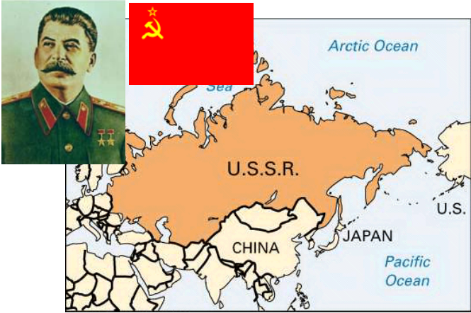
The Soviet Union is the pretender Scarlet Beast of Revelation 17