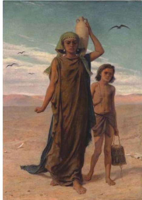
Hagar and Ishmael

47 He that is of God heareth God's words: ye therefore hear them not, because ye are not of God.