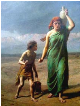
Ishmael and Hagar

Four Score and Six Years Old The age of Abram when Ishmael was born ( below left ), and the age of Abraham Lincoln’s America at the Battle of Gettysburg ( below right )