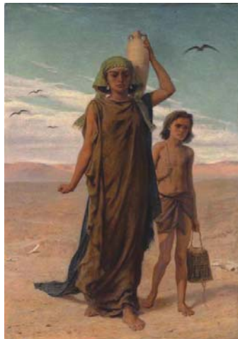
Hagar and Ishmael

Four score and six years old – The age of Abram at the birth of Ishmael, and the age of the United States at the July 1-3, 1863, Battle of Gettysburg, meaning that Abraham Lincoln’s “ new birth of freedom” was represented by the birth of Ishmael.