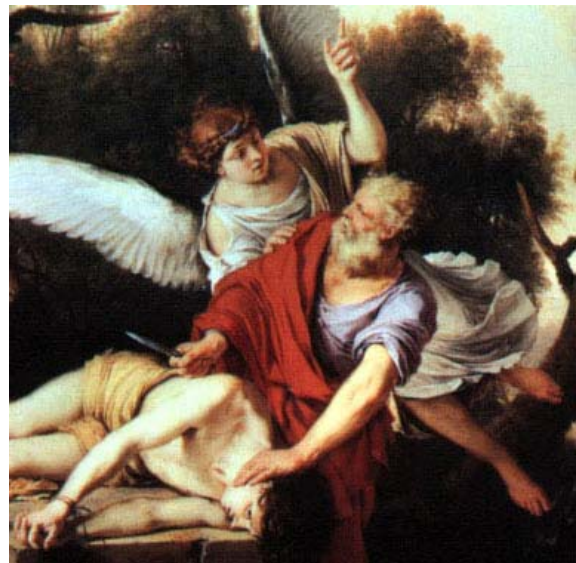
Abraham offering up Isaac

Hebrews 11:8-19 represents the seed of Abraham through Isaac