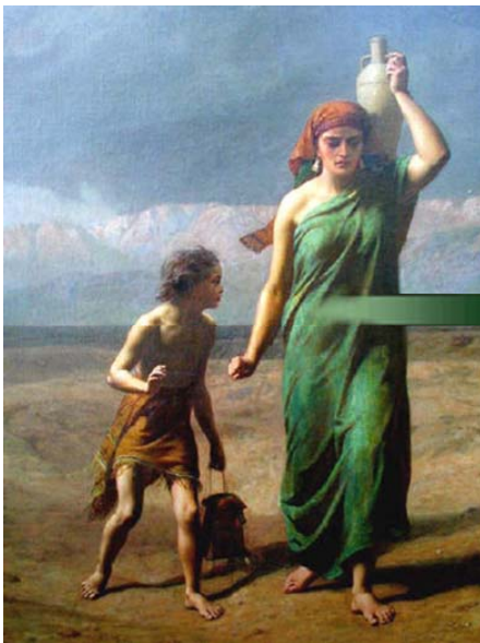
Ishmael and Hagar

Key Understanding: The Ishmael seed of Abraham Lincoln. What the Lord ordained to be represented through the 8:32 p.m. entry of Woodrow Wilson into the chamber of the House of Representatives on April 2, 1917, to give his war message, is that the Body of Americans is spiritually the Ishmael seed of Abraham Lincoln, Making the World Safe for Democracy.