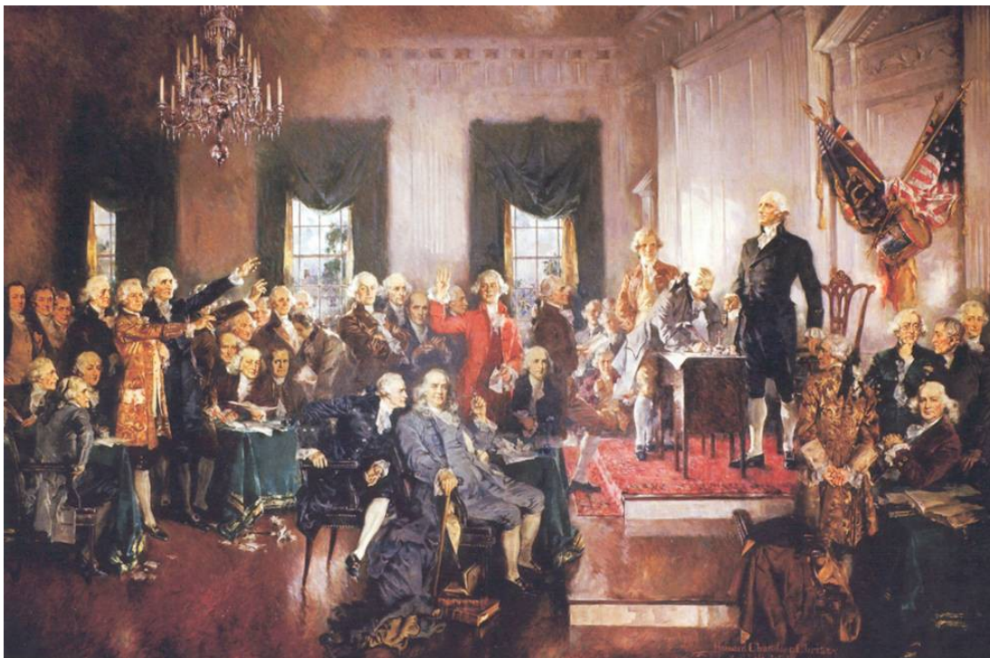
The famous painting of the scene at the signing of the Constitution at the U.S. Constitutional Convention shows convention president George Washington standing on the dias, and Benjamin Franklin prominently sitting ( in the center ), illustrative of his substantial role.

Key Understanding: The ironic counterfeit of “the mind which hath wisdom” of Revelation 17:09. Benjamin Franklin was the mind which had wisdom above all other Americans in the history and folklore of the nation. The Lord ordained Benjamin Franklin – who as the mind which had [human] wisdom played key roles in the birthing of the Beast, the Eighth – to be born in 1706 [= 1709] to specifically fulfill Revelation 17:09 as the ironic counterfeit of