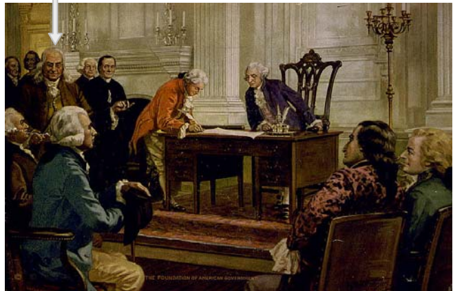
(above left) The Thinker . Enlightenment Era/Age of Reason thinking was the “wisdom” behind the founding fathers of the U.S. Constitution. [Reference Unsealing #449 .]

Key Understanding #2: The counterfeit of the “mind which hath wisdom” birthed the beast out of the pit. The establishment of the U.S. Constitution by Benjamin Franklin and others at the 1787 Constitutional Convention was a major part of the Beast, the Eighth Kingdom, arising out of the Pit in Revelation 17:08. This is why the June 28, 1787, “ establishing governments by human wisdom ” speech of Benjamin Franklin at the Constitutional Convention fulfilled “the mind which hath wisdom” in Revelation 17:09, but as an ironic counterfeit. In truth, the Lord ordained the American mind which had human wisdom – the mind of Benjamin Franklin – to help birth the Beast out of the Pit, which is later identified as such by “the [true, genuine] mind [of Christ] which hath wisdom.”