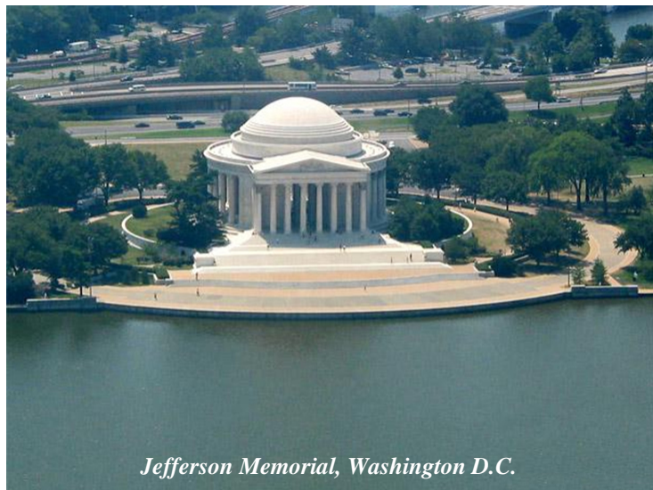
Jefferson Memorial, Washington D.C.

Revelation 17:11-13 (KJV) And THE BEAST that was, and is not, even he IS THE EIGHTH , and is of the seven, and goeth into perdition.