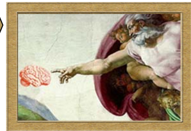
representing “ the mind which hath wisdom ” Revelation 17:9

Revelation 17:09-13 (KJV) And here is THE MIND WHICH HATH WISDOM. The seven heads are seven mountains, on which the woman sitteth.