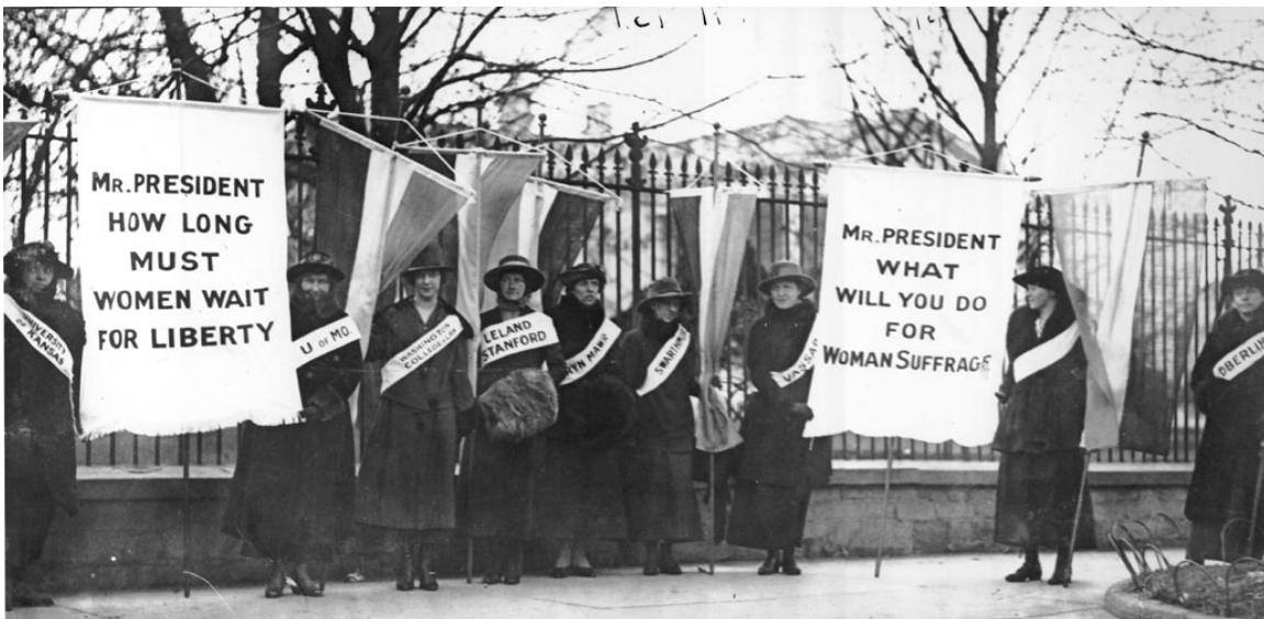
Women picketing outside the White House during World War I

Key Understanding: The Woman of Revelation 17:18 is tied to Babel of Genesis 11:1 because (a) the 19 th Amendment giving women the right to vote (and representing the Woman ) finally came to fruition, due to (b) militant suffragists successfully challenging the hypocrisy of Woodrow Wilson’s World War I goal of Making the World Safe for Democracy (the worldwide Second Babel ), when American women themselves did not yet have the right to vote.