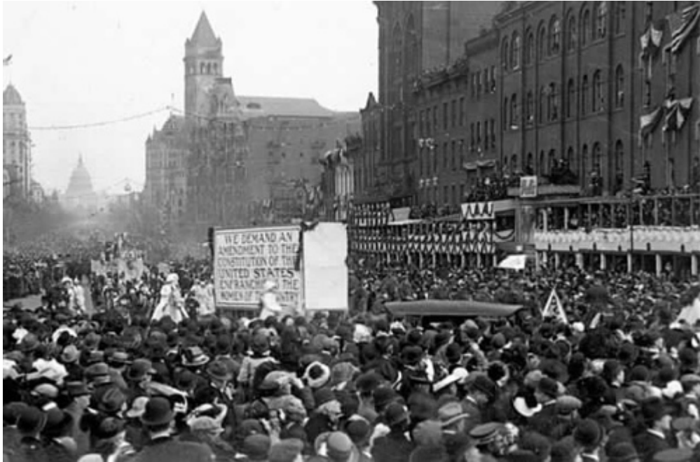
This march/pageant was held on March 3, 1913, the day before President-elect Woodrow Wilson's first Inauguration

Revelation 17:18 (KJV) And THE WOMAN which thou sawest IS THAT GREAT CITY [Babylon the Great], which reigneth over the kings of the earth [by Making the World Safe for Democracy].