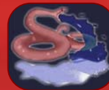
Joel's latter rain