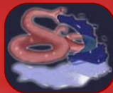
Joel's former rain

Woodrow Wilson's entry into World War I on April 6 [= 9], 1917, brings Joel's Latter Rain. The Woodrow Wilson-led entry of the U.S. into World War I on April 6, 1917, represented the Lord pouring out Joel's Latter Rain on America. Though it exists in the spiritual realm, this is also a counterfeit.