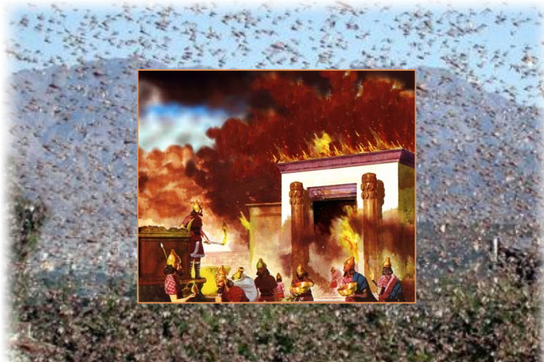
The locusts are in modern day Israel, with the picture in the midst being an artist's impression of Nebuchadnezzar's army attacking Jerusalem (though the picture is of the attack on Jerusalem in 586 B.C., not 605 B.C.)

The 605 B.C. Army in contrast to Joel's Latter Rain. Joel's Armies of Locusts that came upon Judah and Jerusalem included the pair of armies of Sennacherib's Assyria in 701 B.C., and particularly – since it was successful – Nebuchadnezzar's Babylon in 605 B.C. The Lord promised that he would send the Latter Rain , restoring the years of destruction that came as a result of Nebuchadnezzar's 605 B.C. Locust Army . [Note: It can be properly assumed that the 605 B.C. Locust Army of Nebuchadnezzar can by extension prophetically include the subsequent successful sieges of Jerusalem in 597 B.C. and 587-586 B.C. as well, resulting in the destruction of Jerusalem and Solomon's Temple. In other words, 605 B.C. was just the beginning, but it also represents the fullness and completeness of the destruction that would come upon Judah and Jerusalem.]