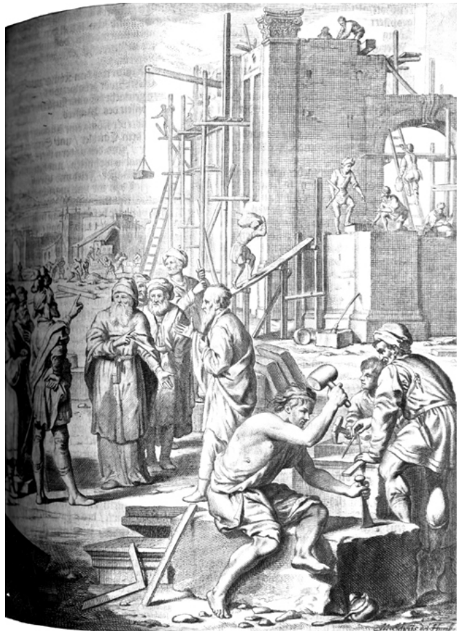
Rebuilding the Temple

Haggai Urged by the prophets Haggai and Zechariah (Ezra 5:1-2), Zerubbabel diligently resumed work on the Temple in the second year of the reign of Darius Hystaspes in Persia (Hag. 1:14). This renewed effort to build the Temple was a model of cooperation involving the captives, the prophets, and Persian kings (Ezra 6:14). Zerubbabel received considerable grants of money and materials from Persia (Ezra 6:4-5) and continuing encouragement from the prophets Haggai and Zechariah. Work resumed on the Temple in 520 B.C. and the project was completed in 516 B.C. The celebration was highlighted with the observance of Passover (Ezra 6:19). If there was a discordant note, it likely came from older Jews who had earlier wept because the new Temple lacked the splendor of Solomon's Temple (Ezra 3:12).