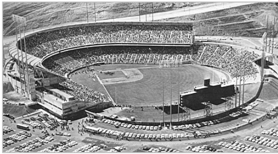
Candlestick Park in 1960

Candlestick Park. After the 1957 Major League Baseball season, the New York Giants baseball franchise moved to San Francisco. A new baseball stadium would be built for the San Francisco Giants at a point of land jutting into San Francisco Bay, south of the city. The point of land was called Candlestick Point, named for the indigenous “candlestick bird,” the long-billed Curlew, once common to the point. The stadium would be named Candlestick Park. It opened on April 12, 1960.