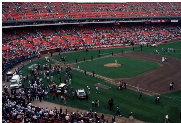
Candlestick Park after the earthquake

3 And TWO OLIVE TREES by it [the April 9, 1906, Latter Rain Pentecostal movement, associated with 'weird babel' in Los Angeles, and the April 6 [= 9], 1917, Joel's Latter Rain U.S. entry into World War I, associated with the birth of the 'Babel' United Nations in San Francisco ], one upon the right side of the bowl, and the other upon the left side thereof.