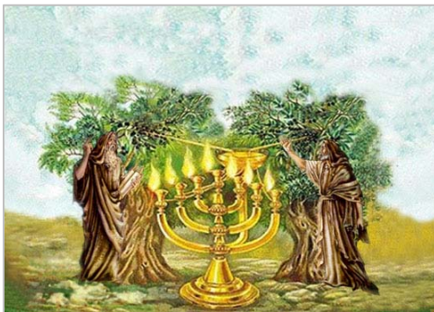
Zerubbabel and Joshua led the Jews out of the captivity of Babylon

4 So he said, " These are THE TWO [the governor, Zerubbabel, in the symbolic office of King , and Joshua in the office of Priest , guiding the people of Judah out of the captivity of Babylon, and into the building of the Temple] WHO ARE ANOINTED to serve the Lord of all the earth. "