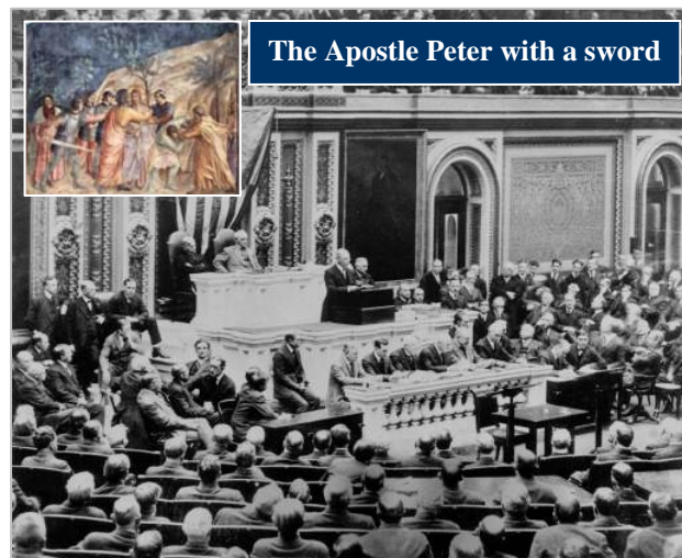
Woodrow Wilson’s “making the world safe for democracy” speech to Congress on April 2, 1917, to enter America into World War I, allied with Russia’s new democratic Provisional Government

Key Understanding: The St. Petersburg sword. The Lord designed history to unfold around St. Petersburg, Russia, as concerns America’s Man o’ War entry into World War I, so as to use the example of Peter and the sword to clarify that the April 9, 1906, and April 6, 1917, Joel’s Latter Rains cannot ultimately be considered the dropping of the Latter Rain of the Holy Spirit of God to build his Latter Rain Church. They instead represent the Latter Rain of the Sword, and also serve as “proof” of just how much the Sword vs. the Cross issue is at the heart of the doctrinal matter as concerns the true gospel of Jesus Christ vs. the false.