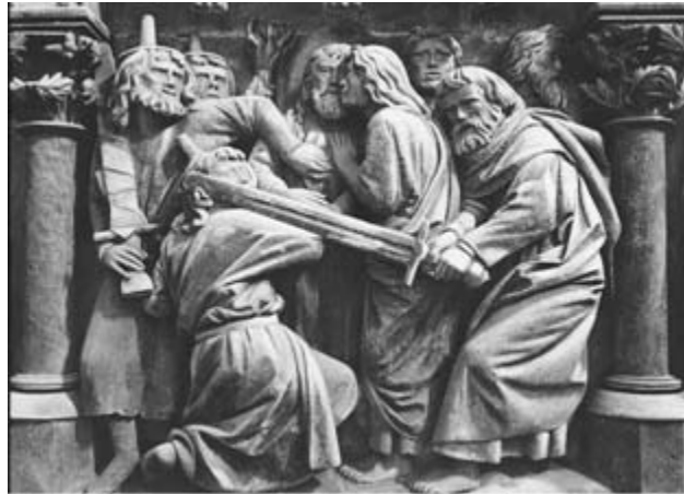
Peter cutting off Malchus's ear with the sword