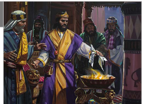
The second Eliakim, King Jehoiakim, burning Jeremiah's scroll, Jeremiah 36:23

The second Eliakim (King Jehoiakim) was unrighteous, and his actions and negative relationship with Jeremiah contributed to the Lord not sparing Jerusalem.