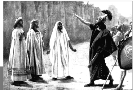
A depiction of Eliakim, Shebna, and Joah meeting with Rabshakeh, 2 Kings 18

The first Eliakim was righteous, and his actions and positive relationship with Isaiah contributed to the Lord sparing Jerusalem.