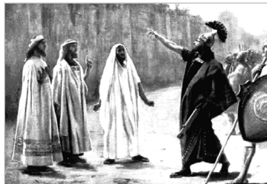
The first Eliakim is as “a father to the inhabitants of Jerusalem, and to the house of Judah” (Isaiah 22:21)

6 And HE SHALL TURN THE HEART OF THE FATHERS TO THE CHILDREN, AND THE HEART OF THE CHILDREN TO THEIR FATHERS, LEST I COME AND SMITE THE EARTH WITH A CURSE.