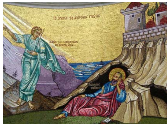
Depiction of Paul receiving the vision of a man of Macedonia saying, Come over into Macedonia, and help us

Acts 16:14 (KJV) And A CERTAIN WOMAN NAMED LYDIA, a seller of purple [purple dye for cloth, or purple cloth or fabrics], OF THE CITY OF THYATIRA, which worshipped God [referring to Lydia], heard us: whose heart the Lord opened, that she attended unto the things which were spoken of Paul.