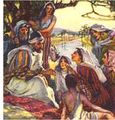
A portrayal of Paul meeting with Lydia

This is to be contrasted with those of the U.S. Grant and Woodrow Wilson church of Laodicea, who ultimately have the spirit of Jezebel of Thyatira, and before whom the Lord stands “ at the door ” of their hearts and knocks. “ If any man hear my voice, and open the door [of his heart], ” the Lord will help him to overcome and will grant him the right to sit with the Lord on his throne.