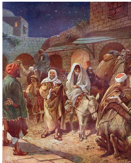
Joseph and Mary travel to the census (Luke 2:1-6)

Key Understanding and Answer: The role of the virgin birth. Among bible scholars, the conventional and simplistic answer to the question is that the Lord created the solution through the miracle of the virgin birth. The virgin birth addressed the curses that God had placed upon Jehoiakim and Jehoiachin. Jesus Christ was exempt from the curses upon Jehoiakim and Jehoiachin because Joseph was not his genetic father. [The assumption that is made with the above explanation, of course, is that the seed of Jehoiakim and Jehoiachin is present through the remainder of the genealogy listed in Matthew 1, including the portion from the person of Zerubbabel down through Joseph, the adoptive father of Jesus.]