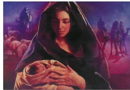
The birth of Zerubbabel is meant to be a picture of the forthcoming virgin birth of Jesus Christ

Key Understanding: Zerubbabel is a picture of Jesus Christ, with the titular legal right to the throne of David coming through the line of Solomon, but the physical descendancy of the seed of David coming through the line of Nathan. Zerubbabel, the builder of the Second Temple, becomes even more so a picture of the Messiah, Jesus Christ, the builder of the Third Temple, with the titular legal right to the throne of David coming through the line of Solomon (Salathiel with Zerubbabel akin to Joseph with Jesus), but the physical bloodline of the seed of David coming through the line of Nathan (Pedaiah and Pedaiah's mother with Zerubbabel akin to Mary with Jesus), a "righteous" Branch in comparison to the "unrighteous" branch of Solomon – "unrighteous" because of the curse of Jehoiakim and curse of Jehoiachin that "none of their seed would sit upon the throne of David." In short, the birth of Zerubbabel is meant to be a picture of the forthcoming virgin birth of Jesus Christ.