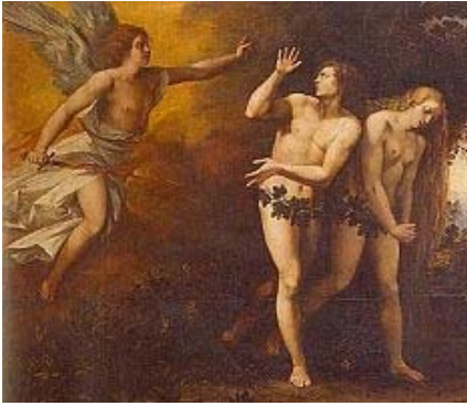
Adam and Eve being expelled from the Garden of Eden

1 Corinthians 15:21-22 (KJV) For since by man came death, by man came also the resurrection of the dead. 22 FOR AS IN ADAM ALL DIE, EVEN SO IN CHRIST SHALL ALL BE MADE ALIVE.