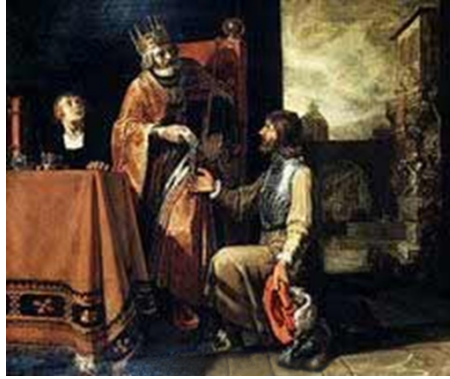
David sends Uriah to the frontlines