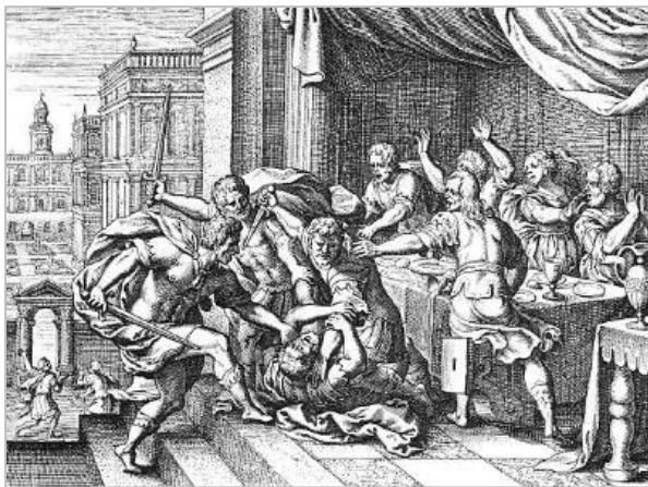
Amnon is killed for raping his half-sister, 2 Samuel 13:28-29

The manifestation of the curse of the sword never departing from the house of David was fulfilled in the short term through the intense difficulties of David with his sons – the slaughter of his sons Amnon and Absalom before his death, and of Adonijah quickly thereafter. Amnon raped Tamar, his half-sister, and after two years, Absalom had Amnon murdered (2 Samuel 13). Absalom later rebelled against David, and Absalom was slain (2 Samuel 15-18). Adonijah was executed by King Solomon after the death of David (1 Kings 2:13-25).