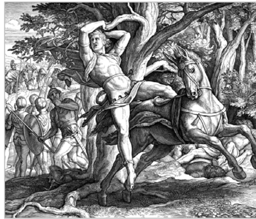
Absalom was killed by Joab while he was hung up in an oak tree, 2 Samuel 18:9-18